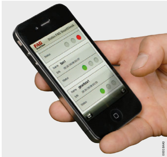
Figure 2 Smartphone as alarm receiver