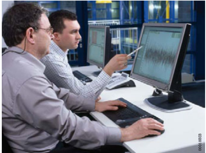
Figure 6 Remote monitoring with data evaluation by Schaeffler

If Schaeffler is tasked with remote monitoring, the customer receives regular reports on the machine condition and recommended actions for improving plant availability. If FAG SmartCheck detects incipient damage, the customer is informed immediately. Repair can then be planned and replacement parts sourced in good time. Further information can be found at www.FAG-SmartCheck.com or by simply contacting us.