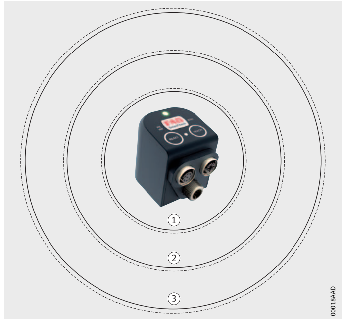
Figure 4 Multistage concept