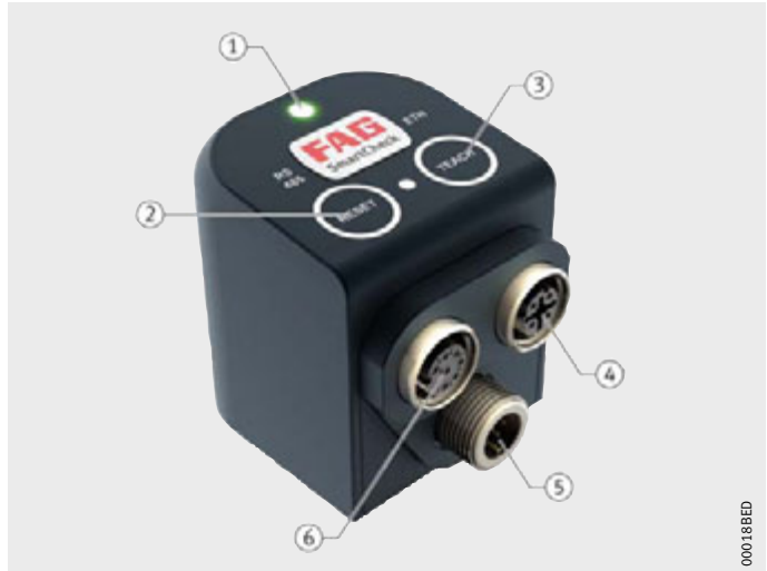
Figure 1 LEDs, keys and interfaces